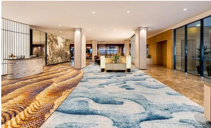
The main foyer of the Pan Pacific Perth.

wide, bright space, and the floor is a mixture of patterned carpet and polished concrete. The entryway and foyer is all on one level and wheelchair-friendly.