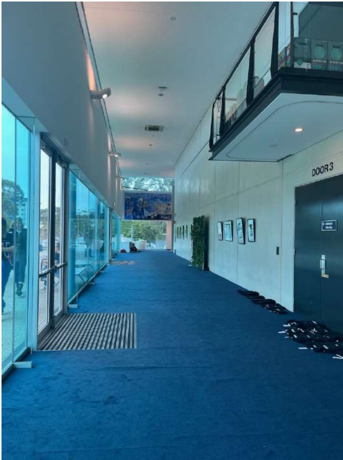
One of the foyers in the John Curtin Theatre building.