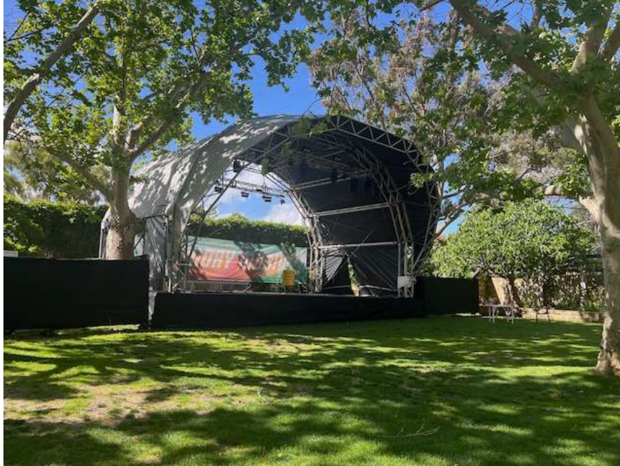
The front garden of the Walyalup Fremantle Arts Centre.