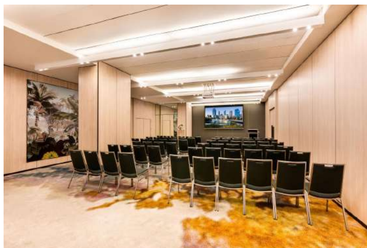
The Goldsworthy Room.

The APAM Floor is a very large rectangle split up by dividing walls, with a foyer in an L shape. The registration desk is in front of the stairs and elevators, and you'll see this when you first arrive on the floor. APAM staff will always be at this desk and able to help you while you're with us. The main rooms sit either side of the foyer, and these are where the majority of APAM sessions and pitches will happen. There'll be rows of chairs in each, and a large stage with TV screens. The Golden Ballroom may have some banquet tables in place too. You'll find the First Nations & Indigenous Space here as well.