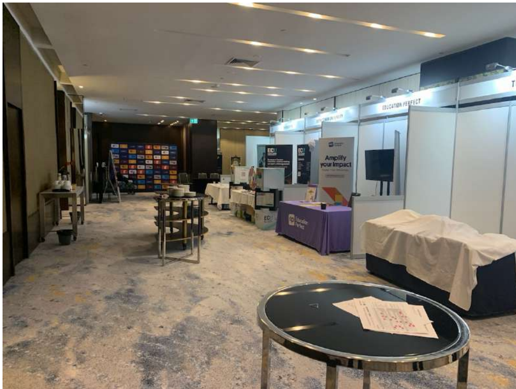
The other end of the APAM Floor. This image is from a different event setup, APAM will look a bit different!

The APAM Floor is a very large rectangle split up by dividing walls, with a foyer in an L shape. The registration desk is in front of the stairs and elevators, and you'll see this when you first arrive on the floor. APAM staff will always be at this desk and able to help you while you're with us. The main rooms sit either side of the foyer, and these are where the majority of APAM sessions and pitches will happen. There'll be rows of chairs in each, and a large stage with TV screens. The Golden Ballroom may have some banquet tables in place too. You'll find the First Nations & Indigenous Space here as well.