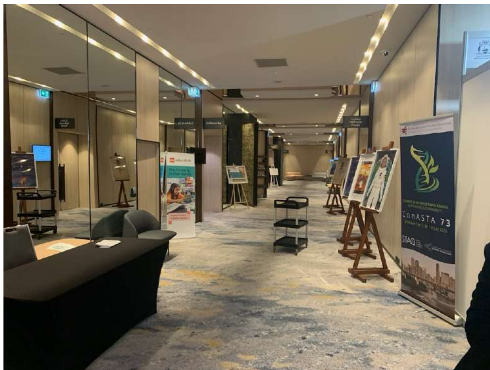
Level 1 at the Pan Pacific Perth, which will be our APAM Floor. Our main rooms branch off the corridor.

From here you can take the stairs or elevators to level one. You'll step out onto the end of the APAM Floor, right by our registration desk, where a friendly APAM staff member will welcome you. If it's your first time with us, we'll ask for your name and you'll be given your APAM name badge and a lanyard to wear. The name badges are made of eco-friendly bamboo and the lanyards are black fabric. The registration desk is also where you can ask APAM staff any questions or get some help if you need it. All APAM staff and volunteers wear bright red lanyards, so they're easy to spot.