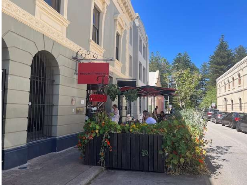
The front of the Moores Building in Walyalup Fremantle. Below: The Gallery room being used for APAM.