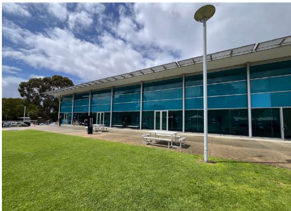
The main entry of the John Curtin Theatre.

We have arranged coaches to transport delegates from the Pan Pacific to the Theatre. Because of the size of the Theatre's car park, the coach will drop you just down the road, at a public bus stop. You'll walk up a paved path and around the corner, cross the road, and you'll be at the front of the building.