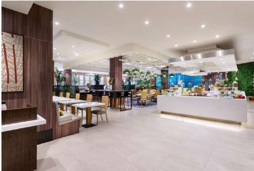
Monty's restaurant is near the stairs and elevators.

From here you can take the stairs or elevators to level one. You'll step out onto the end of the APAM Floor, right by our registration desk, where a friendly APAM staff member will welcome you. If it's your first time with us, we'll ask for your name and you'll be given your APAM name badge and a lanyard to wear. The name badges are made of eco-friendly bamboo and the lanyards are black fabric. The registration desk is also where you can ask APAM staff any questions or get some help if you need it. All APAM staff and volunteers wear bright red lanyards, so they're easy to spot.