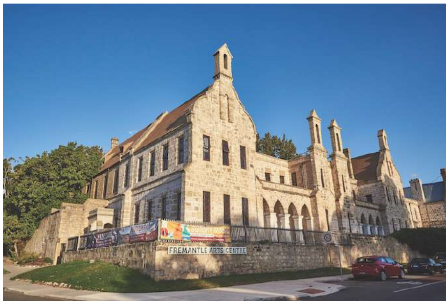
Walyalup Fremantle Arts Centre.

Walyalup Fremantle Arts Centre (WFAC) is a major WA arts organisation, offering a rich program of exhibitions, residencies, art courses, music and events. They are generously hosting APAM delegates for an evening of networking and conversation in the beautiful front garden which is shaded by London plain trees. Their gorgeous gift shop will also be open, showcasing a great range of gifts and crafts from local WA artists and makers.