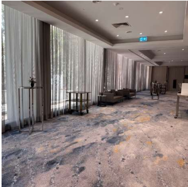
Foyer 3, which is around the corner from the registration desk and main foyer spaces. This area will house some of the daily catering and leads to the Quiet Room and Prayer Room.

At the end of the APAM Floor back by the elevators are several doorways leading into another foyer, and additional, smaller rooms. Some of these rooms will be used for sessions and some are used as delegate spaces, including the Quiet Room and the Prayer Room. These spaces are all well-lit, some with natural light, with carpeted floors and plain décor. Depending on how the room is being used, it will be set up with chairs, a screen, microphones, or some small couches and desks.