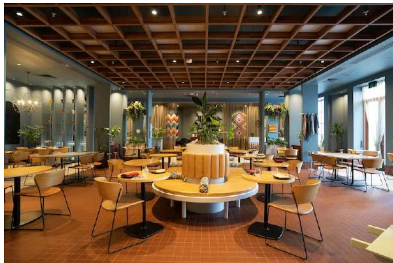
UMA Restaurant, Pan Pacific Perth.

When you're in the foyer, you'll find the check-in and reception desks in front of you. To your left and right are public sitting area with couches, chairs and tables. Behind this is the Más Vino wine bar, and behind that is the UMA Restaurant and Bar UMA, a modern Australian eatery with a South American flair.